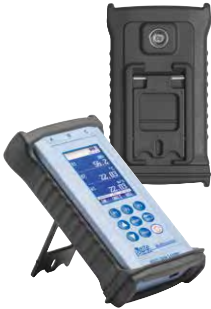
Hard rubber protective cover (55 SHORE) with stand and magnet for use in harsh environments