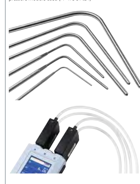
... Details in data sheet HD 31.

Measuring ranges, 2..40 m/s to 2..130 m/s, depending on the probe design (T1 to T4) and the SICRAM differential pressure module used (PP 473 S1 ..S4)