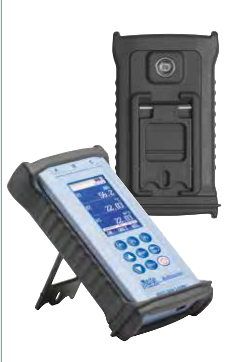
Hard rubber protective cover (55 SHORE) with stand and magnet for use in harsh environments

Stabilized power supply, 100..240 VAC, 5 VDC, output type A USB plug