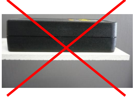
False: material too thin