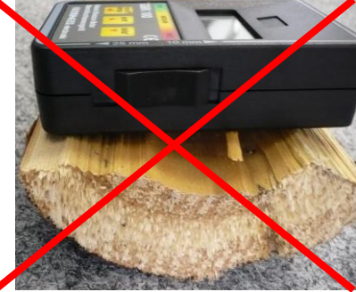
False: wrinkled surface (extreme example!)

Here are some examples for measurements that are not precise at all. (Measured value too dry in all cases):