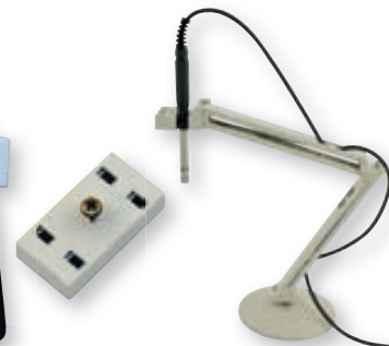
GEH 1 with probe