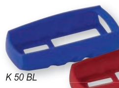
K 50 BL