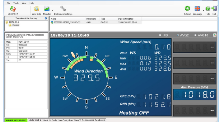
HD52.3D -S software: viewing the real time measurements

The PC software HD52.3D-S allows configuring the instrument, viewing the real time meas-urements both graphically and numerically, managing graphical presentation, printing and export in Excel® format of the data acquired with the Monitor function.