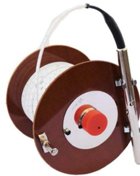
Water Level Meter on hand reel (up to 50m)

The high-precision-measuring-tapes are available with cm/mm markings or feet and 1/100th foot markings.