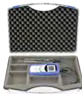
Fig.: GMH3831 in ST-RN