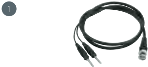
GMK 38 Item No. 601261 Measuring cable, BNC to 2x banana plugs