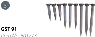
GST 91 Item No. 601273 Steel pins 9 steel poles (3 each, 12, 16 and 23 mm long) in plastic box, Ø 2.5 mm