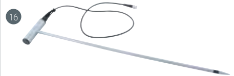
GSF 40 (67 cm)

Suitable for: wood chips, wood wool, wood shavings, straw, hay, grain, sawdust, etc.