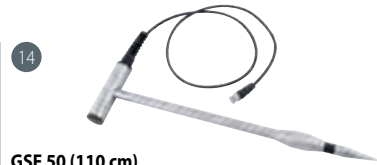
GSF 50 (110 cm)