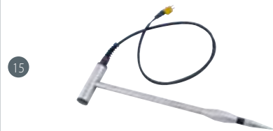
GSF 50TF (110 cm)

Suitable for: wood chips, wood wool, wood shavings, straw, hay, grain, sawdust, etc.