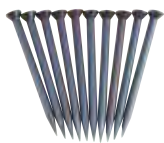
GST 91/40 Item No. 601275 Steel pins 10 steel poles, 40 mm long, Ø 2.5 mm, in a plastic box